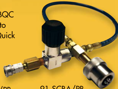
91-SCUBA/PB Adapter Assy. SCBA 4500 BOT/PB